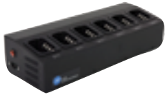
TPA-CH-011 Smart Multi-charger